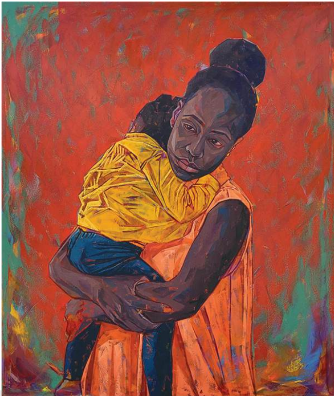
SIZE: 132.08 X 111.76 CM TITLE: UNTITLED PRICE : $4000