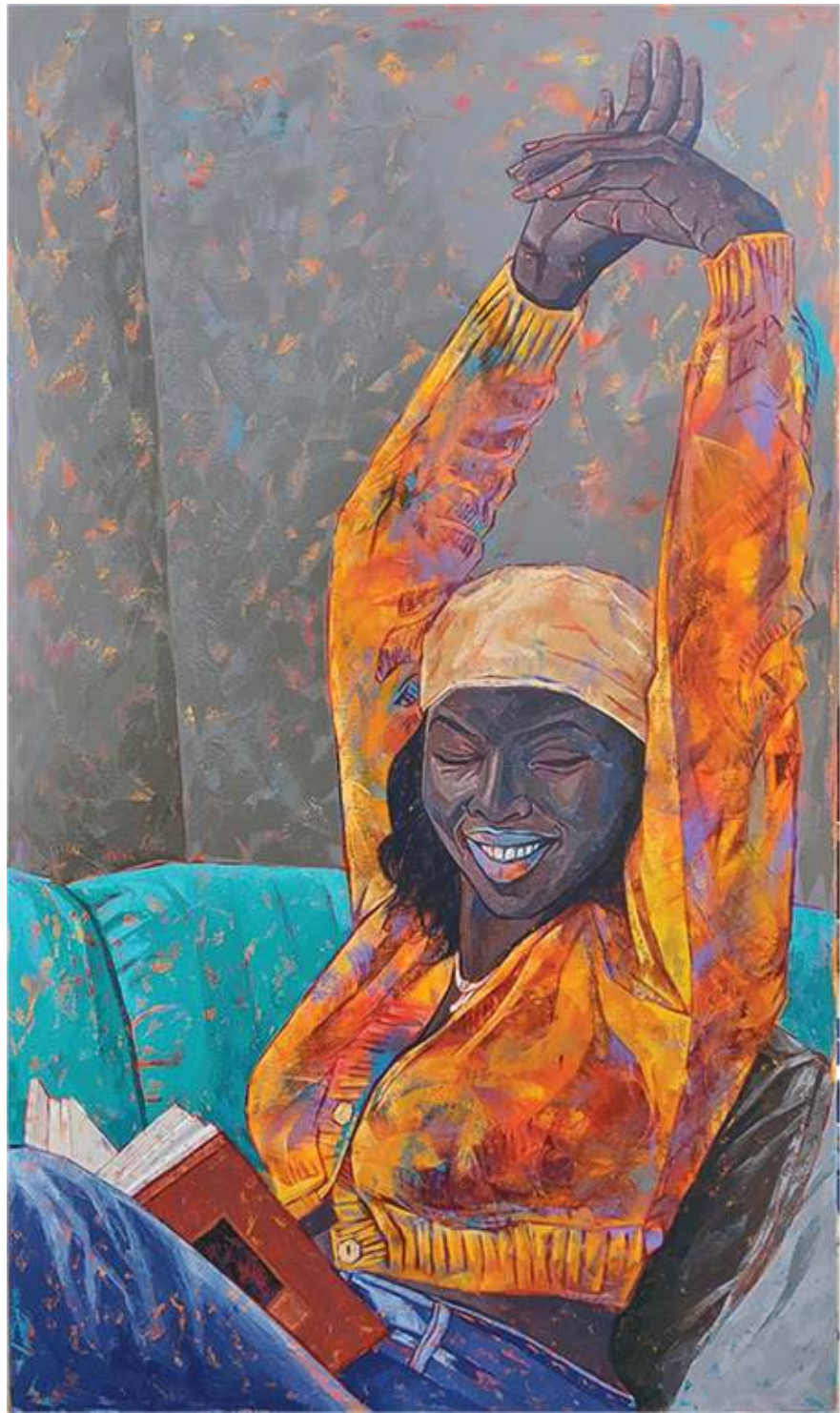
SIZE: 215.9 X 127 CM TITLE: DUCHENNE SMILE PRICE : $7000