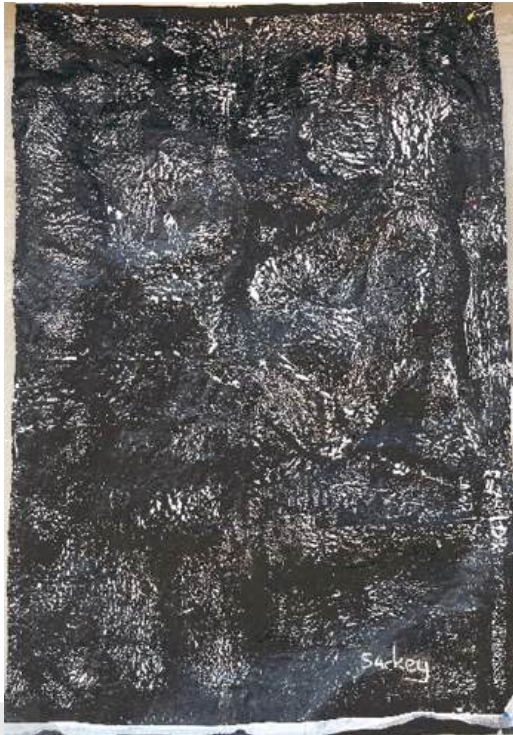
SIZE: 38 X 50 TITLE: SELF LOVE MEDIUM: RECYCLED RUBBER BAGS PRICE : GHC 22,000