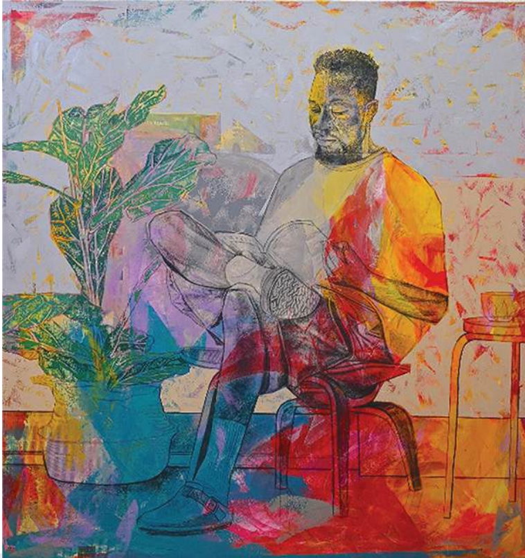
SIZE: 190.5 X 182.88 CM TITLE: UNTITLED PRICE : $7000