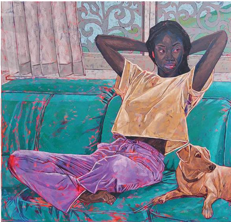
SIZE: 190.5 X 182.8 CM TITLE: KNOCK KNOCK PRICE : $7000