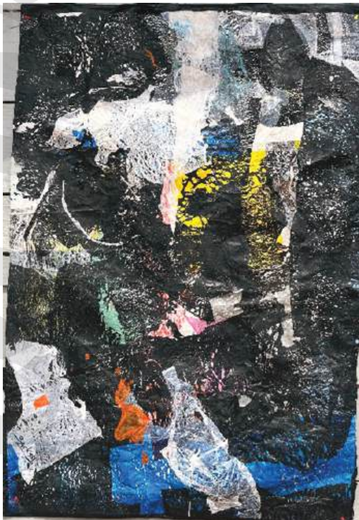
SIZE: 48 X 54 TITLE: HARMONY MEDIUM: RECYCLED RUBBER BAGS PRICE : GHC 23,000