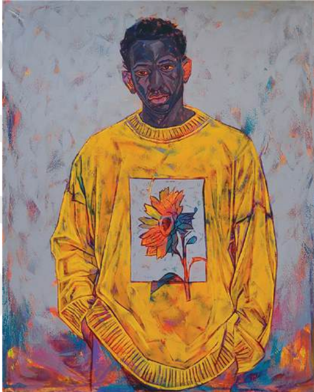
SIZE: 127 X 101.6 CM TITLE: SUNFLOWER TOP PRICE : $4000