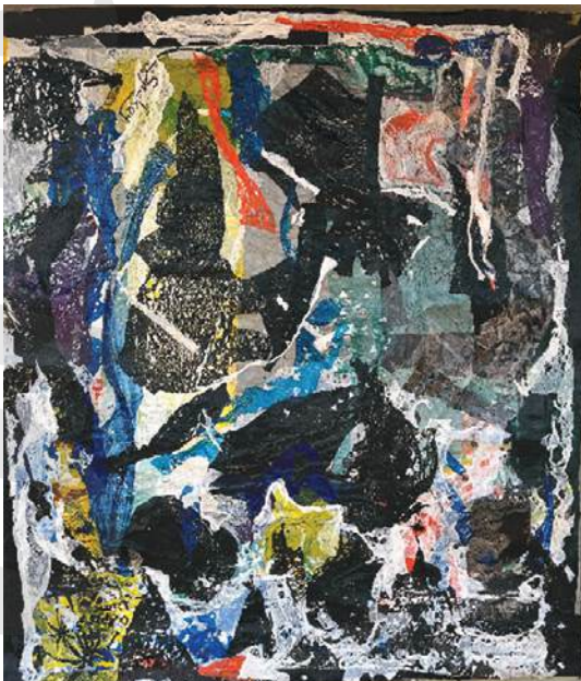
SIZE: 46 X 49 INCHES TITLE: GOOD SAMARITAN MEDIUM: RECYCLED RUBBER BAGS PRICE : GHC 16,000