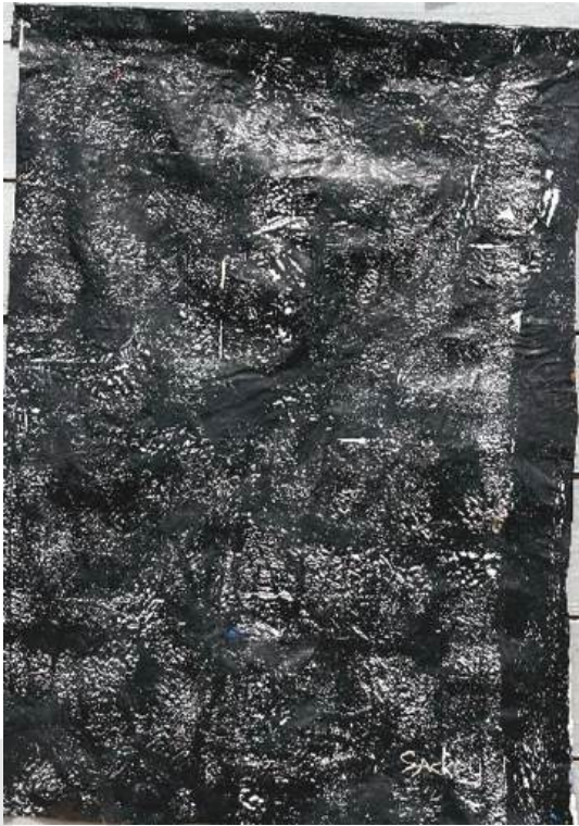
SIZE: 48 X 56 INCHES TITLE: BRIGHTER PATH MEDIUM: RECYCLED RUBBER BAGS PRICE : GHC 22,000