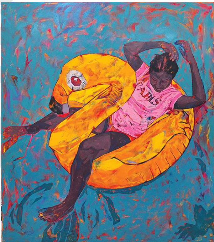
SIZE: 139.7 X 124.46 CM TITLE: UNTITLED PRICE : $5000